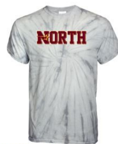
YOUTH/ADULT SPIDER TIE DYE