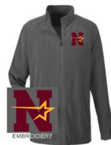
M/W/Y FLEECE JACKET