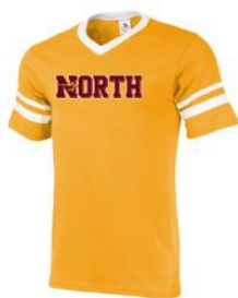
YOUTH/ADULT JERSEY TEE