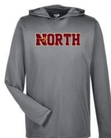
YOUTH/ADULT LS HOODED TEE