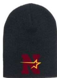
ONE SIZE FITS MOST KNIT CAP