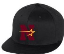
ADULT FLEXFIT® FLAT BILL CAP